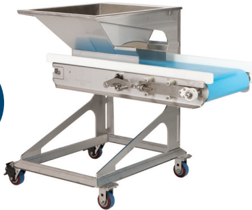
Infed belt system with hopper