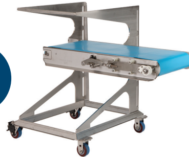
Side boards removed