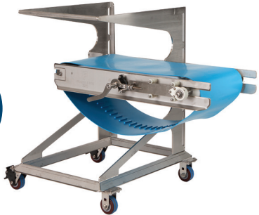
Belt tensioner dis-engaged